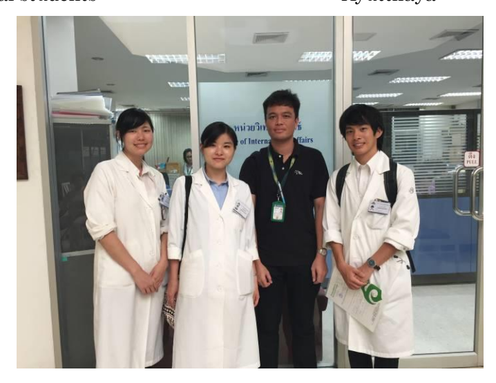
The last day