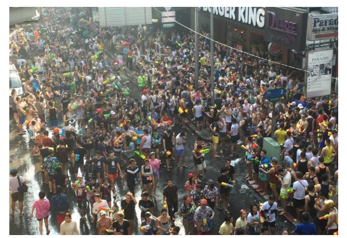
Songkran in the city center