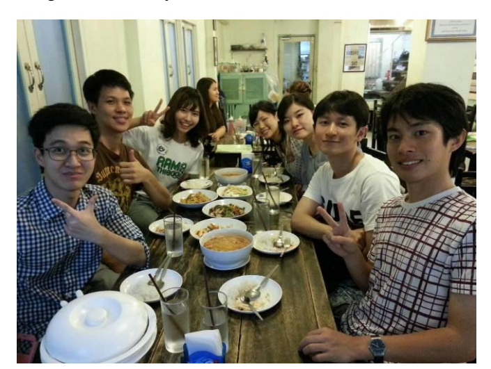
Dinner with Thai students